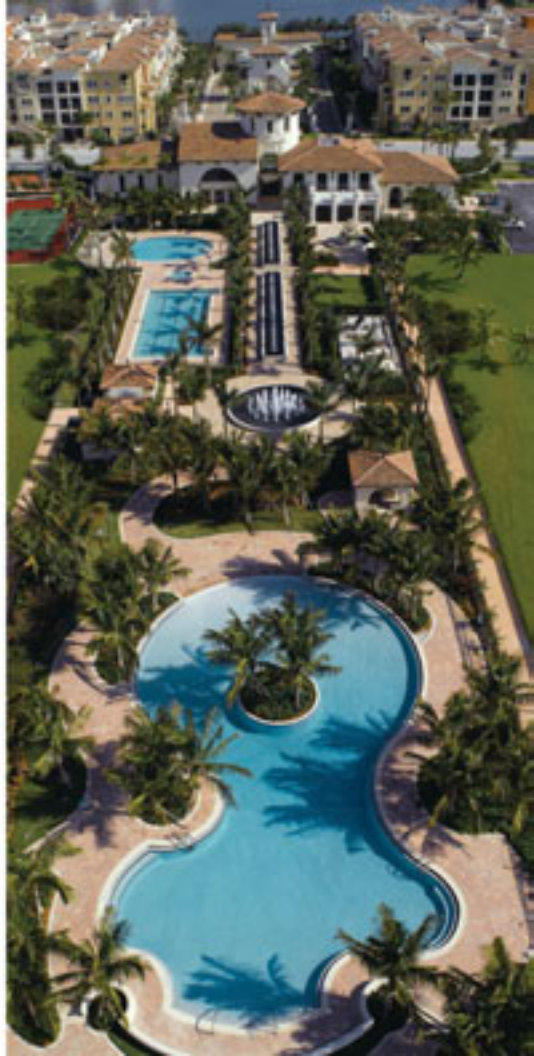
PHOTO: The estate-like clubhouse at Artesia in Sunrise, Florida stands as the focal point for the resort community of eleven hundred multifamily homes.

"Ultimately, Affinis Architects agrees to create projects that have a strong identity — an identity that is capable of reinforcing sales. For both custom residences and resort community projects, the design approach takes context, market demands, and the desires of the client into consideration, regardless of location," says Kurik. "The firm is constantly moving forward, researching and employing new construction materials and techniques to stay current with architectural trends. Affinis Architects is prepared to take the latest homebuilding technologies and its innovative designs well into the twenty-first century."