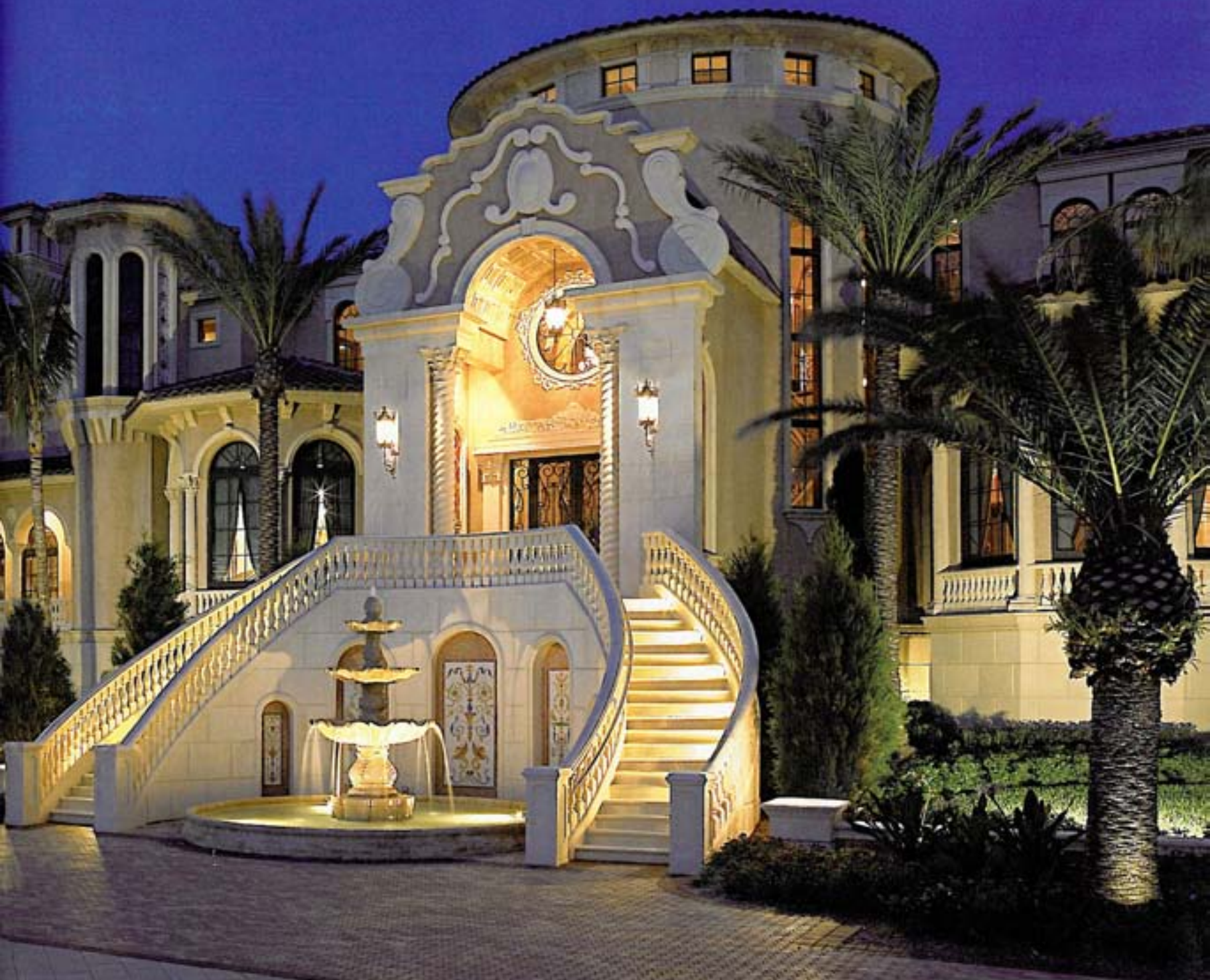
HIGH GROUND A tiered fountain framed by mosaic-filled murals and a double staircase creates a grand transition from the driveway to the first floor of the home, which is situated a level above ground.