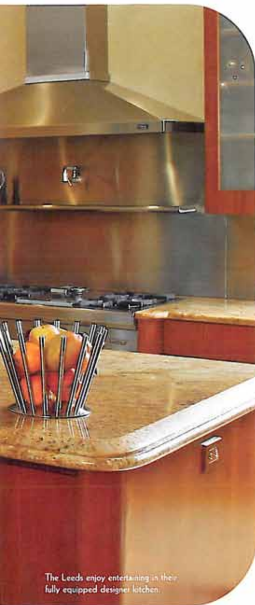
The Leeds enjoy entertaining in their fully equipped designer kitchen.

awaits. The second level boasts three guest suites, all decorated differently. What they all have in common: From the bolster pillows, headboard fabrics and queen duvet covers to the custom ottomans, topaz drapes and end panels, everything here is top of the line.