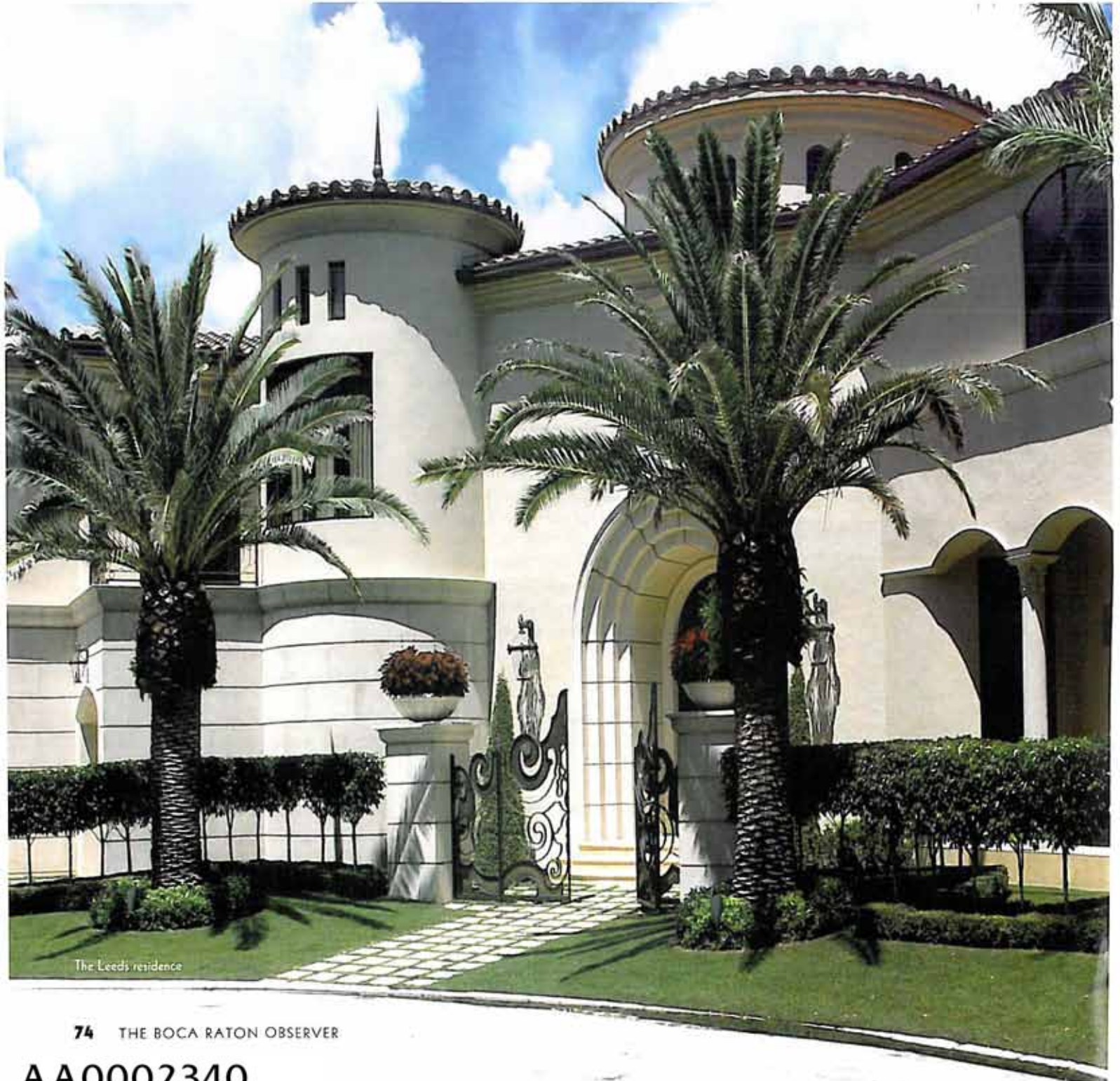
The Leeds residence