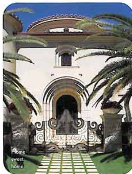
Home sweet home

XVI two-door credenza, which then leads one to His-and-Her walk-in dressing rooms. But it's the sleeping quarters where designer Curtis House's work truly dazzles. Here, even the window treatments are engineered works of art, with four layers of draperies featuring decorative Pindler & Pindler topaz-colored end panels and swags along with motorized sheers and black-out lining. Murano glass again appears in sconces and chandeliers.