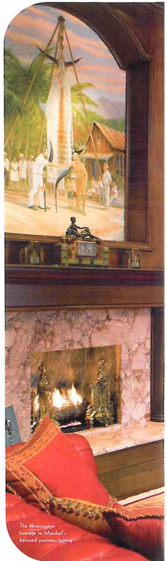
The library pays homage to Marshall's beloved pastime, fishing.

In the nearby bar area Marshall chose to eliminate the need for ice chests, electing instead to incorporate two concealed sinks below water-jet cut tops. Lined along the bar are chairs with carved Dolphin motifs; an expansive glass wall affords striking, panoramic views of the private bird sanctuary and Intracoastal. Adjacent to the bar, a Schumann & Sons piano is capable of playing hundreds of pre-programmed titles via remote control, an elegant touch when the lights are dimmed to a candlelight hue.