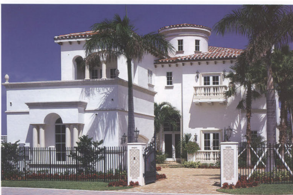
ABOVE: Balconies incorporated on the front of the home offer depth, perspective and the creation of additional living space.

Knowing that there are many options, the next question is what type of balcony will work best. There are three types of balconies: an overlook, which is small enough for a person to stand out on it; a sitting balcony, offering room for chairs and other furniture,