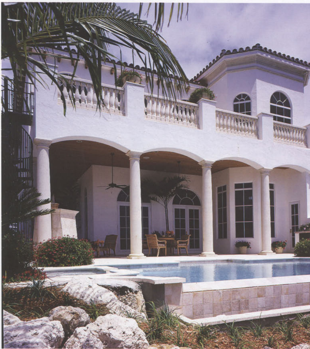
BELOW: This dramatic stone arch balcony creates an opportunity to take advantage of the beautiful pool and gazebo view.