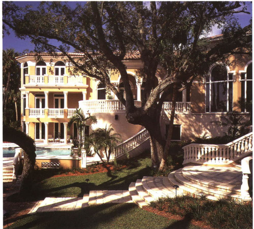
BELOW: Each level of this estate home was designed to include balconies, which creates architectural interest.