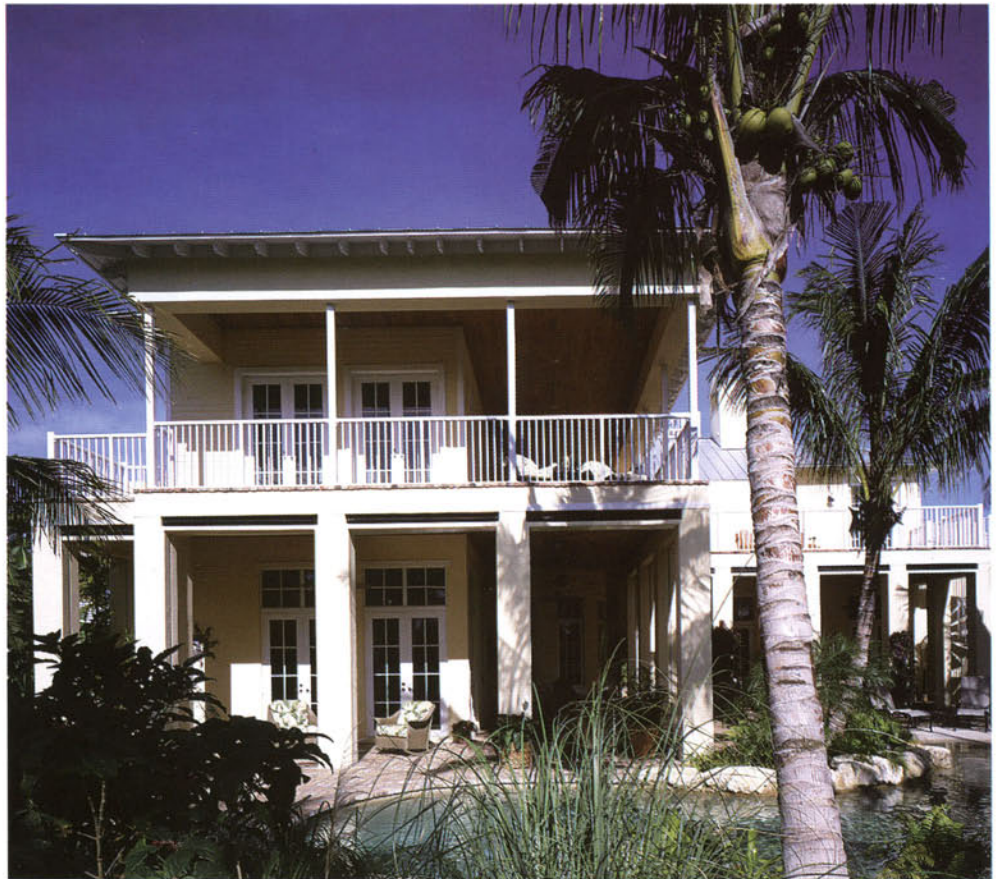
ABOVE: A West Indies designed home will have more open and airy balcony spaces.

The most important consideration is to make the balcony as practical as possible, especially since they can cost as much as finished interior space. It shouldn't be a place never used, collecting dirt and dust, where you need a hose to wash it off and use. A practical application must be applied so that the balcony can be a functional, as well as esthetically pleasing addition to the home. ☀